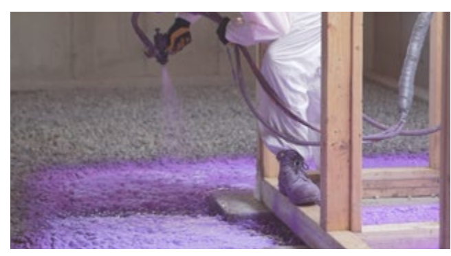
WALLTITE® CM01 sprayed directly on gravel for under slab

100 mm granular fill with geotextile, or 115 mm granular fill