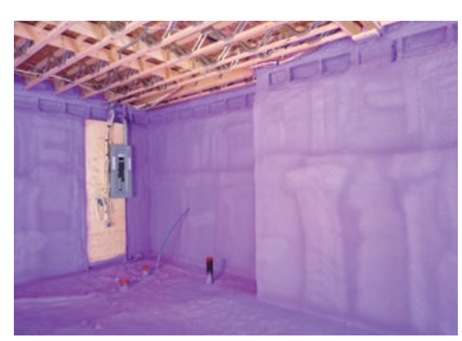
WALLTITE® CM01 applied on basement walls and under slab